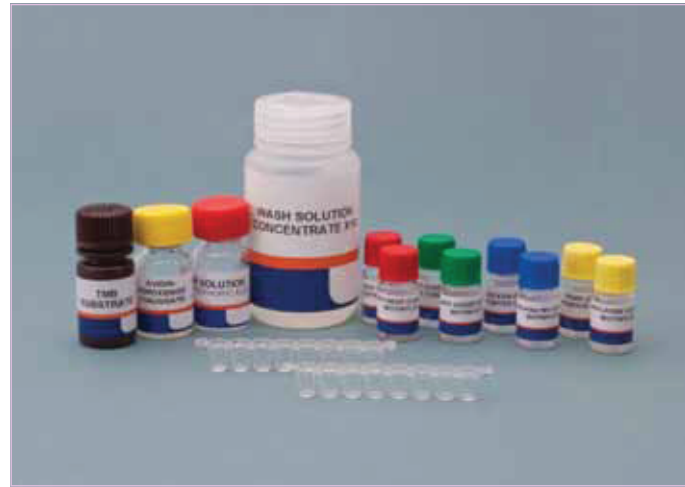
BioKits Speciation Microwell Assay

The identification of species content is performed in many countries for a variety of reasons including economic, ethnic and safety. Such identification may be designed to prevent the substitution of meat destined for human consumption with that of unsuitable or inferior species, or may be of importance in various religious communities where consumption of a particular species is proscribed. Concern about the consumption of ruminants (cattle, sheep) infected with bovine spongiform encephalopathy (BSE, a.k.a. “mad cow” disease) led the FDA to ban the feeding of rendered ruminant by-products, such as meat and bone meal (MBM), to other ruminants. Neogen Corporation supplies a variety of test methods including lateral flow, microwell, and PCR (DNA) based methods for species identification.